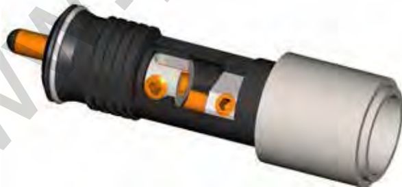
Conductor connection construction Image

Furutech's beautifully finished, beautiful sounding locking collets RCA Connector are the result of meticulous engineering and careful audition of various suitable materials. The FT-111 features an \alpha (Alpha) pure copper one piece conductor for minimal impedance and nonmagnetic SUS set screw construction design, extremely insulated POM body with nonresonant SUS housing and end ring.