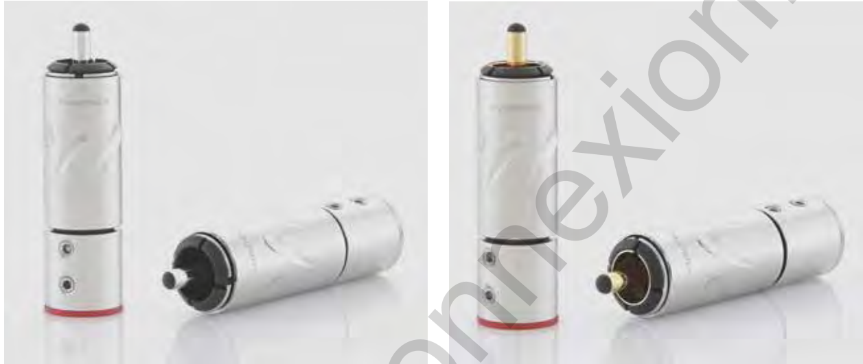
FT-111 (R) RCA Connector

Furutech T-111 Locking Collet RCA Connector Premier Performance and Legendary Build Quality