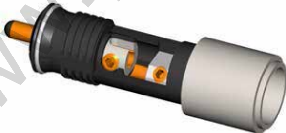
Conductor connection construction Image

Furutech's beautifully finished, beautiful sounding locking collets RCA Connector are the result of meticulous engineering and careful audition of various suitable materials. The FT-111 features an \alpha (Alpha) pure copper one piece conductor for minimal impedance and nonmagnetic SUS set screw construction design, extremely insulated POM body with nonresonant SUS housing and end ring.