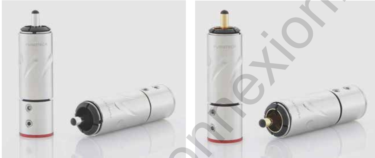
FT-111 (R) RCA Connector

Furutech T-111 Locking Collet RCA Connector Premier Performance and Legendary Build Quality