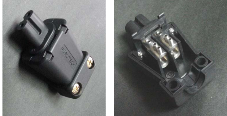
FTECH-73608 FI-8N (G) Set Screw Type