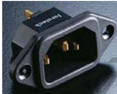
AC Inlet(R) Rhodium Plated FTECH-65010