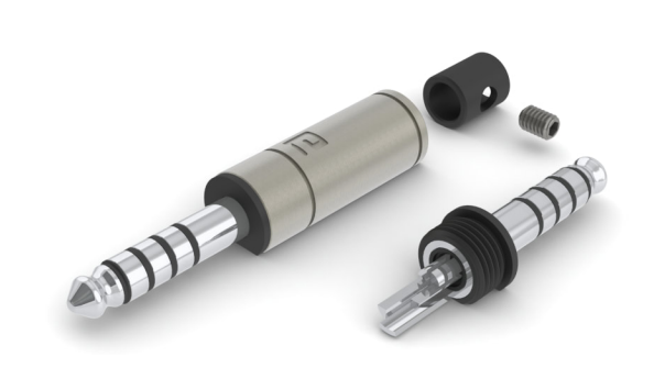
aeco TRS AT4-1812R