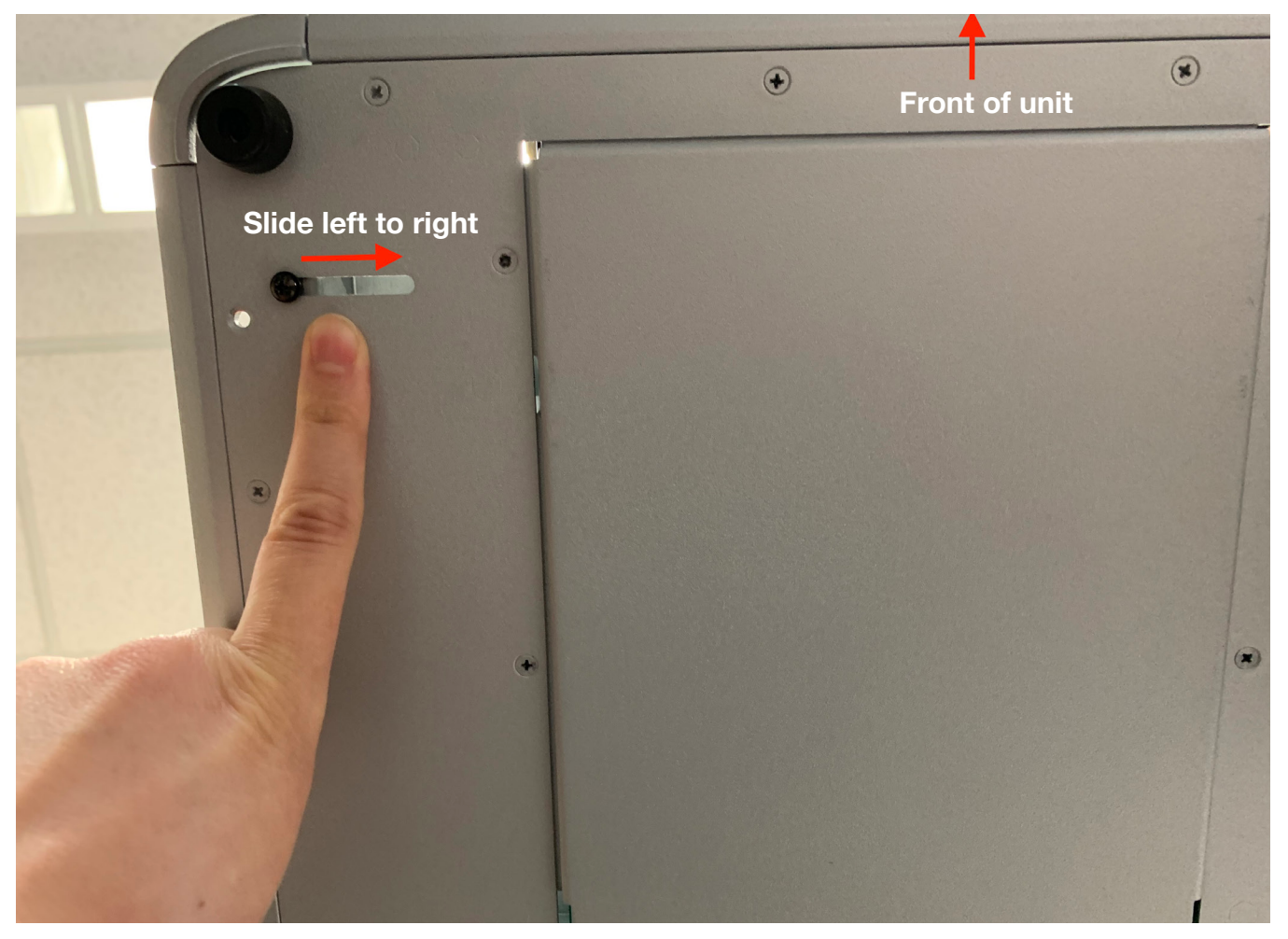
PS Audio® Inc. 800-PSAUDIO 4865 Sterling Drive Boulder, Colorado 80301

On the bottom panel of the PST, there is a screw. While facing the bottom of the unit, use your hand/fingers to slide the screw along the slot from left to right (towards the center of the unit). This will engage the release mechanism, manually sliding the disc door open so the disc can be retrieved. If the screw is tight and cannot be moved, use a screwdriver to loosen the screw slightly so the mechanism can be slid along the slot. Do not completely unscrew.