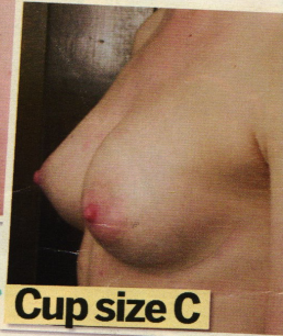
Cup size C

After using Macrolane, Becky's breasts increased in size and were left with a smooth appearance