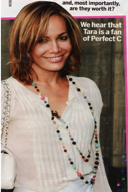
We hear that Tara is a fan of Perfect C

Even celebrities such as Sienna Miller and Tara Palmer-Tomkinson are choosing surgery-free alternatives that cost less and need no recovery time. But what are these new methods, what do they claim to do and, most importantly, are they worth it?