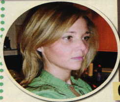
Cup size A