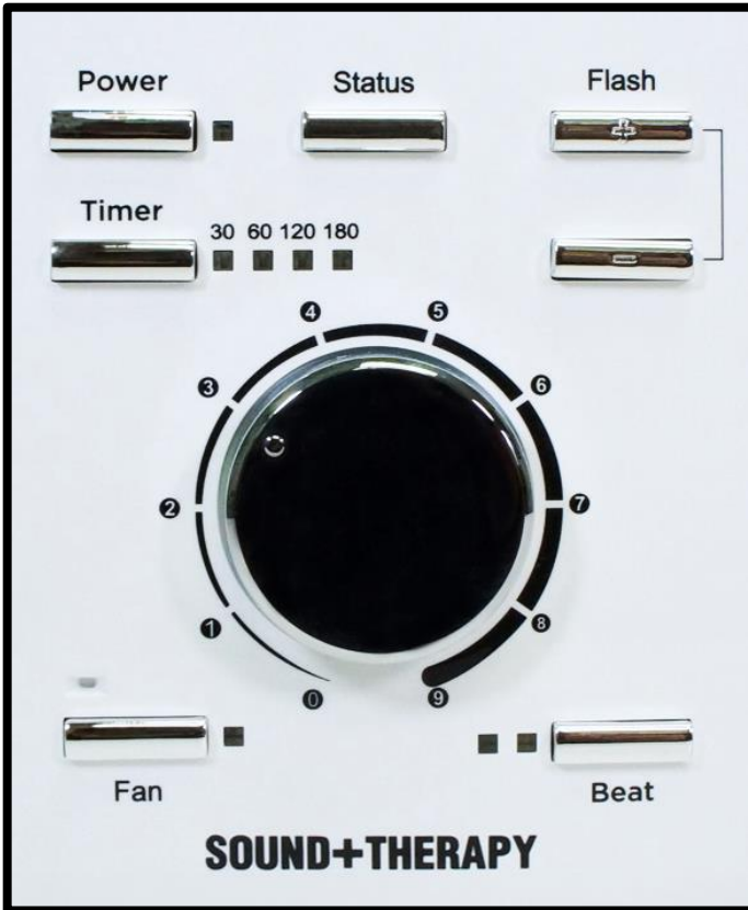
Figure 1.0 - Control Panel