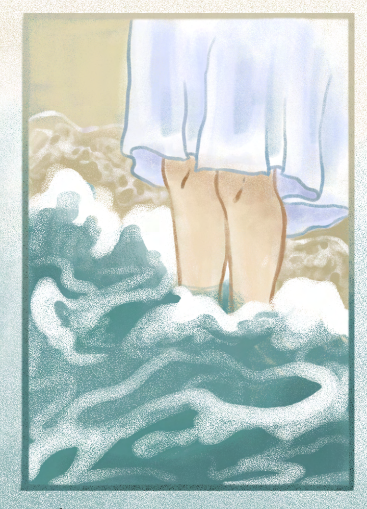
without me next time.