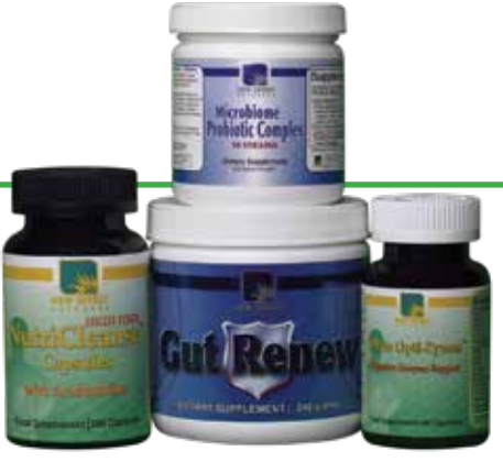
Digestive Health: Balance, Cleanse, Detox