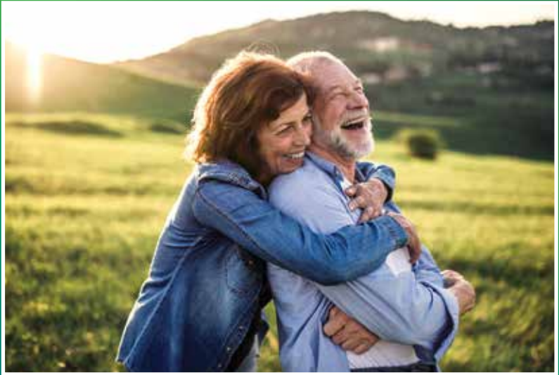
LOVE THE LIFE YOU LIVE • LIVE THE LIFE YOU LOVE