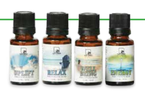
Essential Oils: For Your Well-Being