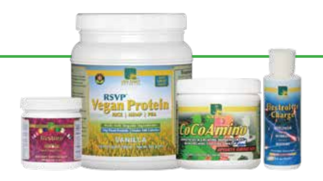
Active Nutrition: Strength, Energy & Performance