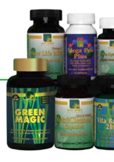
The Wellness Every Day N