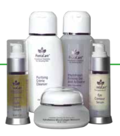
PentaCare™ Skin Care: Age Defying Botanicals