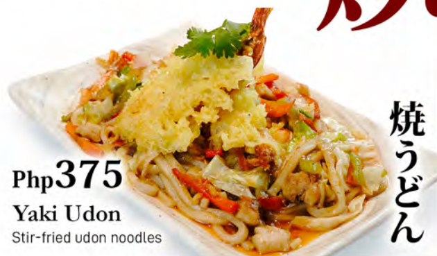
Php375 焼うどん Yaki Udon Stir-fried udon noodles