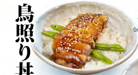
Php310 Tori Teri Don Grilled Chicken Teriyaki over Japanese rice