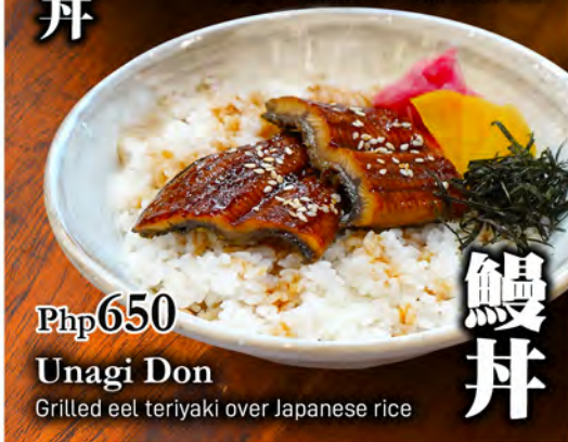
Php650 鰻丼 Unagi Don Grilled eel teriyaki over Japanese rice