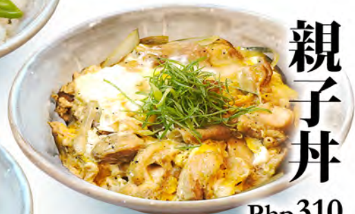
親子丼 Php310 Oyako Don Boiled chicken thigh with onions, eggs and donburi sauce over Japanese rice