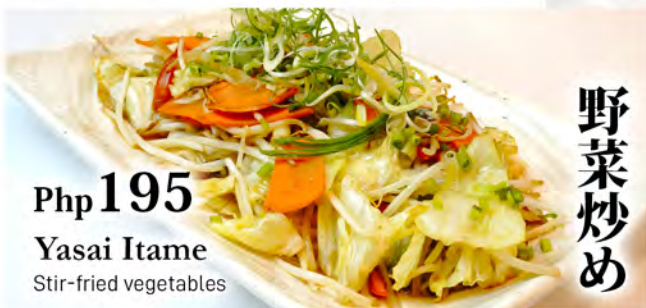
Php195 野菜炒め Yasai Itame Stir-fried vegetables