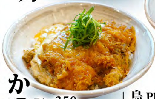
かつ丼 Php350 Katsudon Breaded pork cutlets w/ egg sauce over Japanese rice