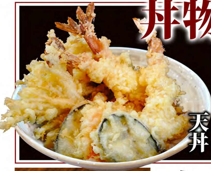
天丼 Php420 Ten Don Shrimp tempura with veggies over Japanese rice