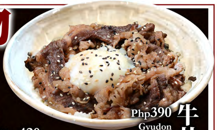
Php390 牛丼 Gyudon Marinated beef shortplate with onsen tamago over Japanese rice