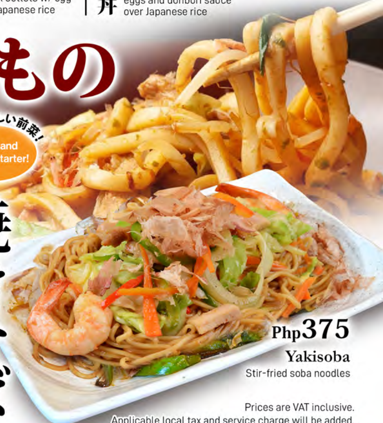
Php375 Yakisoba Stir-fried soba noodles

Prices are VAT inclusive. Applicable local tax and service charge will be added.