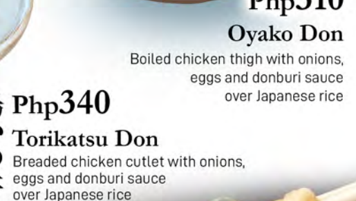
Php340 鳥かつ丼 Torikatsu Don Breaded chicken cutlet with onions, eggs and donburi sauce over Japanese rice