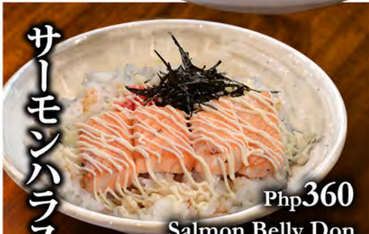
サーモンハラス丼 Php360 Salmon Belly Don Salmon belly over Japanese rice