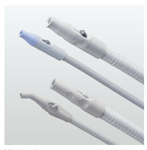
High-volume evacuator handpiece & Saliva ejector Belmont & Dürr