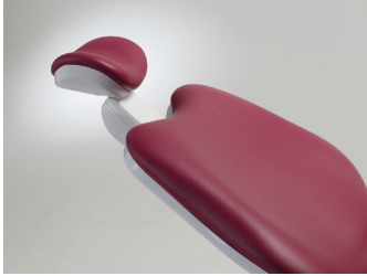
055 Power headrest

Patient-friendly chair offering the most pleasant consultation position possible.