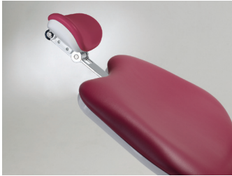
050 Twin-articulating headrest

Ultra-slim backrest improves Operator's working comfort