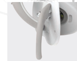
HANDLES REMOVABLE AND AUTOCLAVABLE