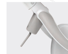
THE PROGRESSIVE ILLUMINANCE ADJUSTING