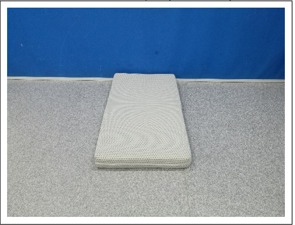
Received sample (side view)