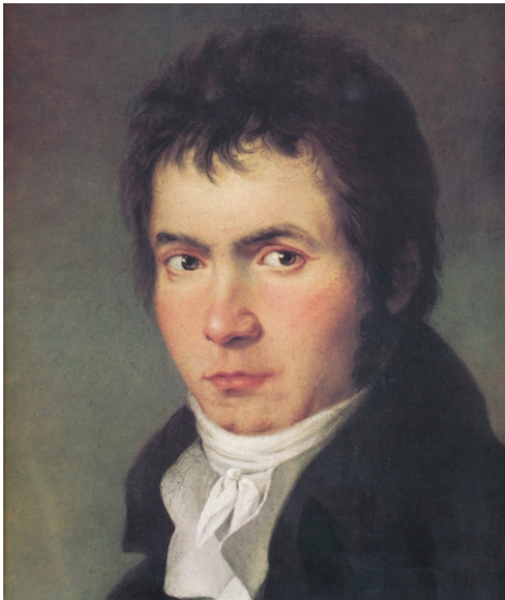
Ludwig van Beethoven (1804) by Joseph Willibrord Mähler (1778–1860)