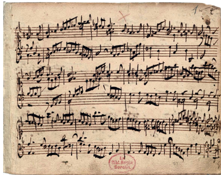
Fragment of 'Courante' from French Suite in D minor, BWV 812 Berlin, Staatsbibliothek zu Berlin – Preußischer Kulturbesitz D-B Mus. ms. Bach P 224 [1. Klavierbüchlein der A. M. Bach, 1722]