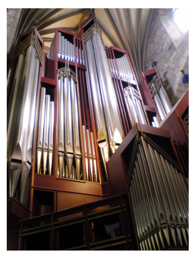
The organ of St Giles' Cathedral, Edinburgh

This magnificently constructed and contrasted collection of hymn Fantasies begins with a strident Fantasy on the Advent hymn tune 'Helmsley' (Lo! he comes with clouds descending), marked by the composer as 'Exultant and fast'. The second Fantasy is based on the Lutheran chorale 'Aus der Tiefe', from the Nürnbergisches Gesangbuch of 1676 and mostly associated with the Lenten hymn 'Forty days and forty nights' in the Anglican tradition, and is much more chromatic and searching. The characterful Fantasy on 'Lumetto' follows, which is subtitled 'Little canonic variations on 'Jesus bids us shine''.