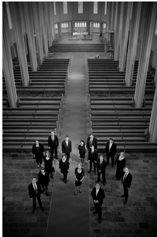
Schola Cantorum Reykjavík

Scores of the works from this recording can be obtained from the Icelandic Music Information Centre ( www.mic.is ).