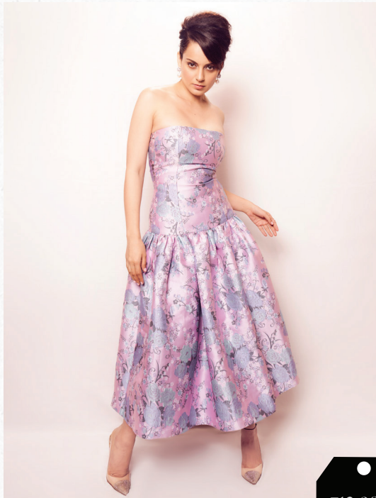
KANGANA RANAUT IN STARDUST'S BELLFLOWER MIDI DRESS