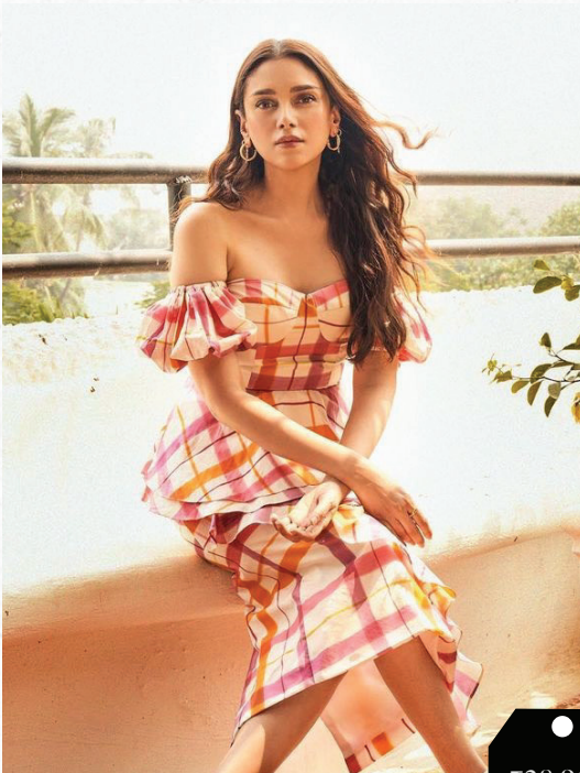
ADITI RAO HYDARI IN ROCKAWAY CHECKERED SKIRT SET

Get inspired by the stars and elevate your style with our curated collection of celebrity-approved designs.