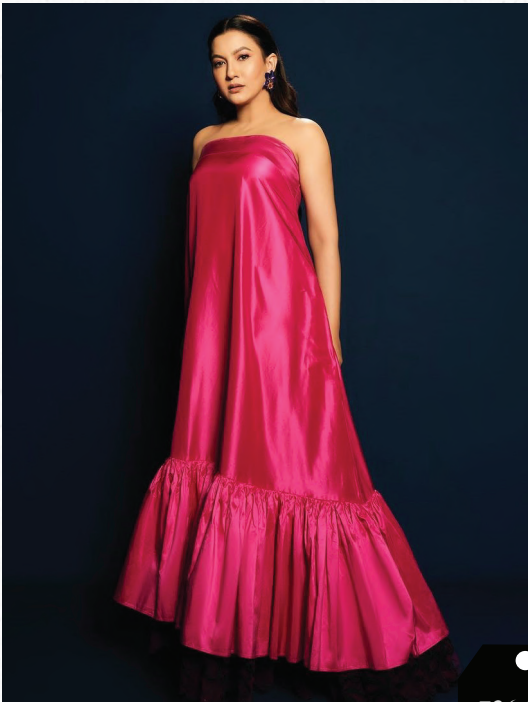
GAUHAR KHAN IN BROOKLYN QUEEN MAXI DRESS