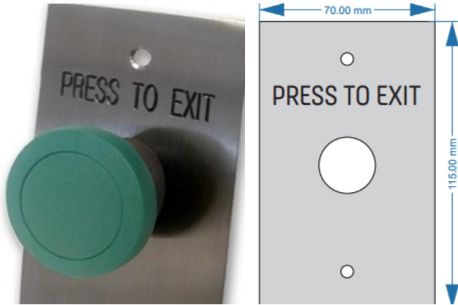
Mushroom Operators (40 mm and 60 mm)