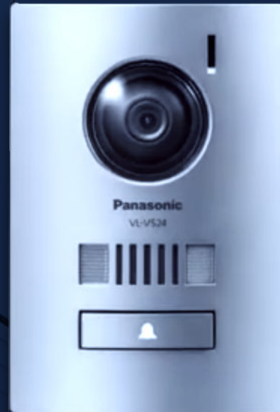
VL-V524LCE 1.3MP SENSOR Door Station