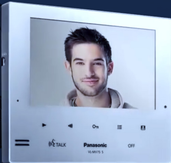
VL-MV75AZ-S 7" INCH MONITOR Silver