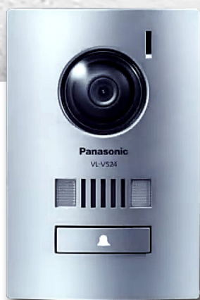
VL-V524LCE 1.3MP SENSOR Door Station