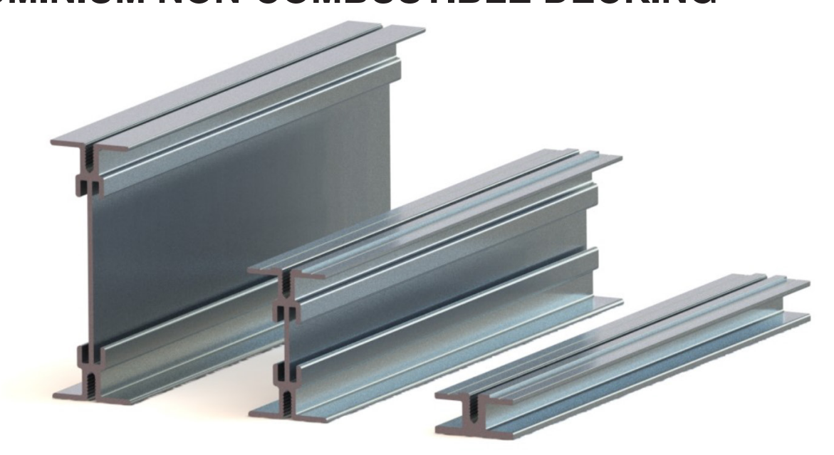
Synergised subframe come in 3 heights to cover all your base needs.

Fully non-combustible aluminium decking system designed for both residential and commercial environments such as high-rise balconies, walkways, roof terraces, pubs, gardens and all other high-rise applications and public areas.