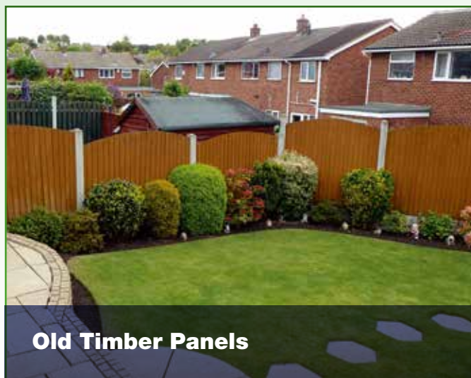
Old Timber Panels