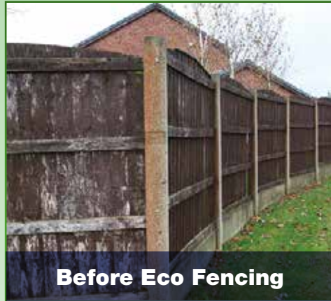
Before Eco Fencing