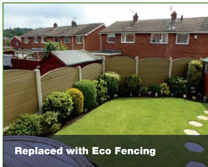
Replaced with Eco Fencing