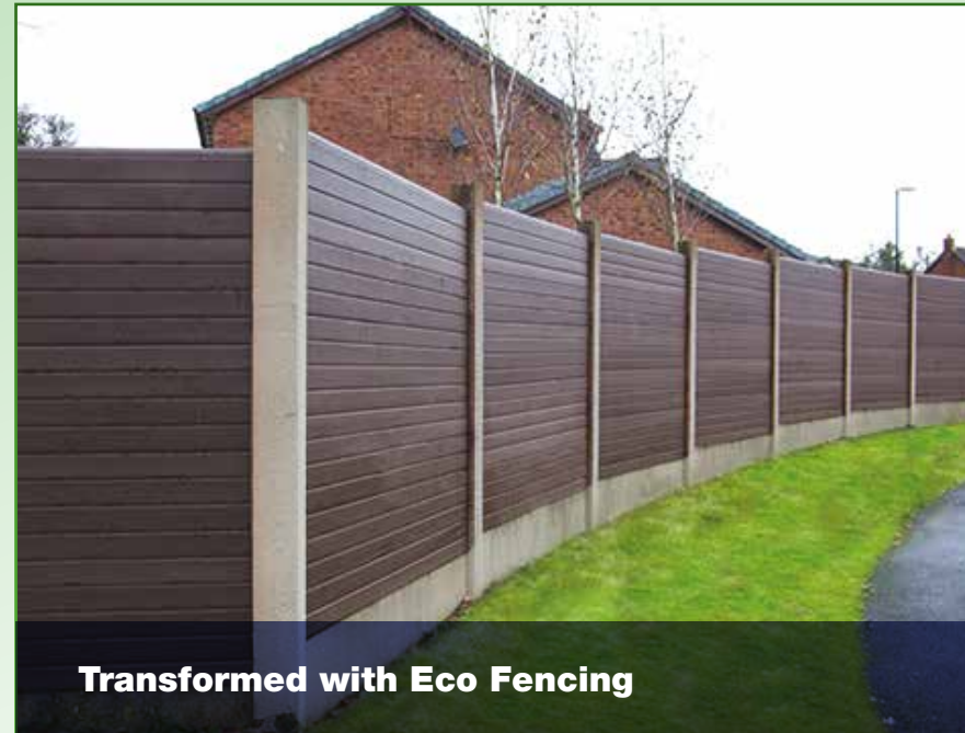
Transformed with Eco Fencing