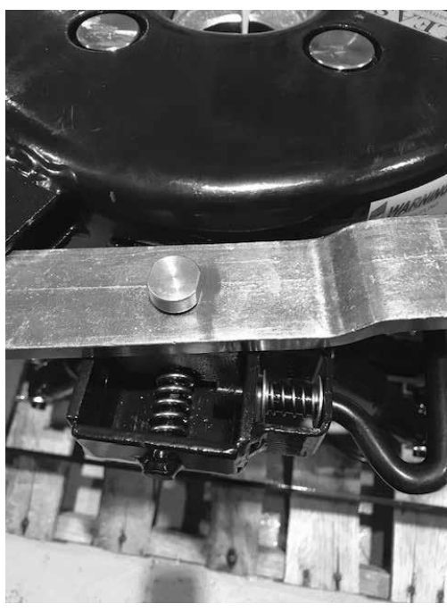
Locked Position Retaining pin view