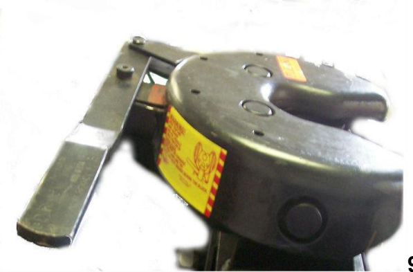
9 O'clock Position (Auto Lock)