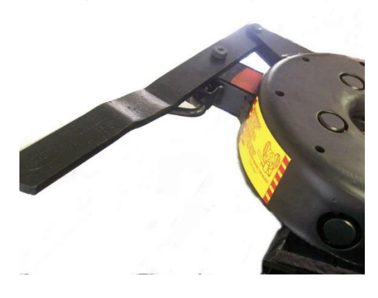
10 O'clock Position (jaws locked open)