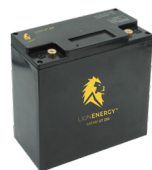
Lion Safari UT 250