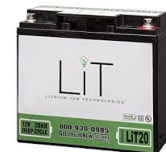
Lithium-ion Tech LiT20