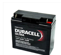
Lead Acid - Duracell Ultra