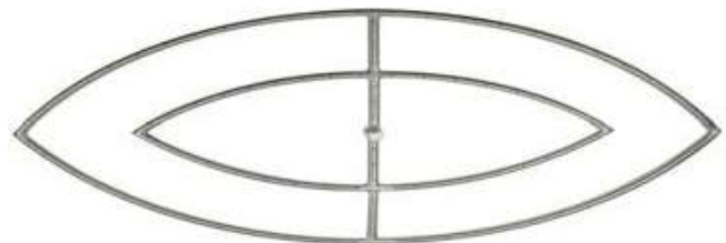
Double Fish Eye Burner