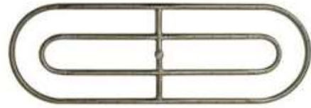
Double Racetrack Burner