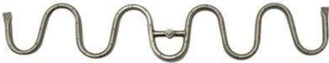
Switch Back Burner