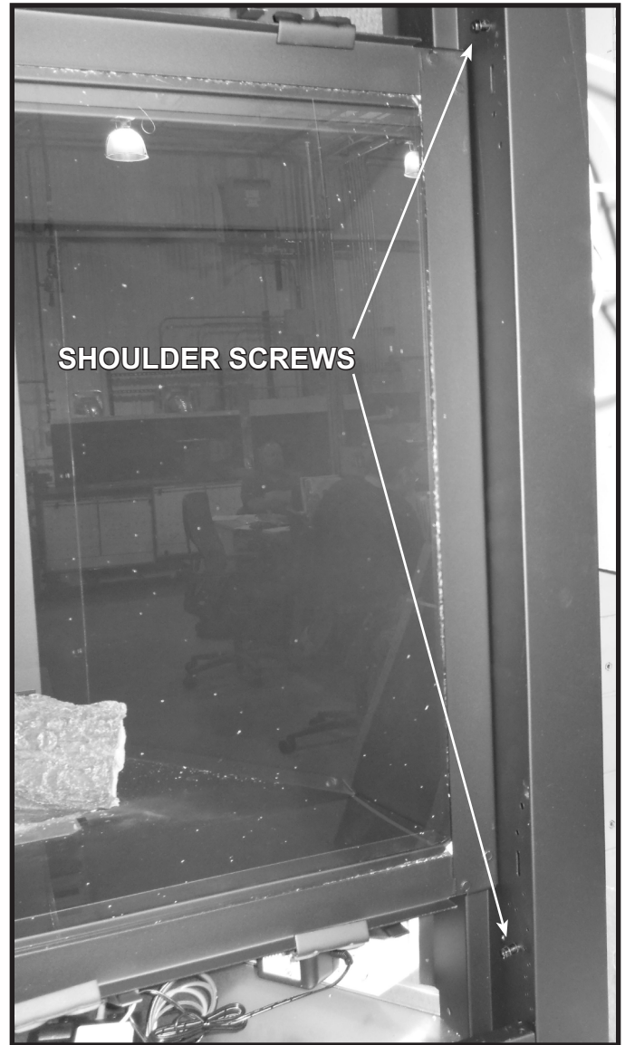
Figure 5. Hang Decorative Front on Shoulder Screws

Note: It may be necessary to adjust the hanging brackets slightly to make the decorative front hang squarely in the appliance opening.