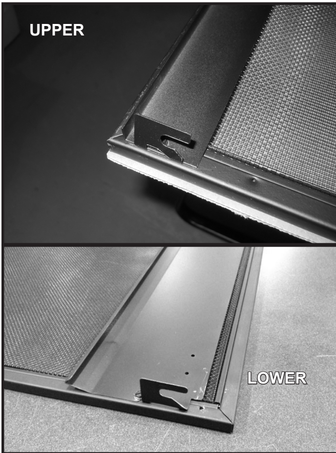
Figure 4. Hanging Hooks Bent Correctly