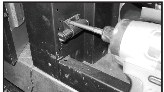
Figure 1. Remove Screws from Magnetic Latches