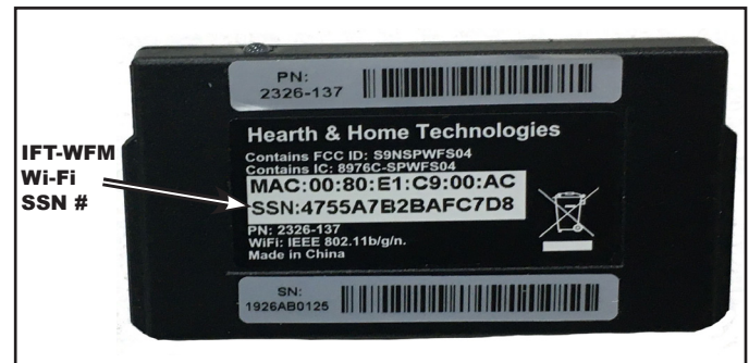
Figure 1 IFT-WFM Wi-Fi SSN # Location

CAUTION! Do not install damaged components. If you received components that are damaged, contact your dealer for assistance.