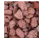
Lava Rock 6.6 lbs / 3 kgs