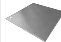
Stainless Steel Lid ONF01-216D (OFG221-SS)