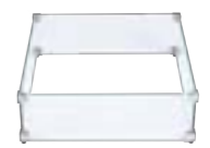
Wind Screen ONC05-003A (OFG224-WS)