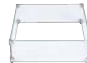
Wind Screen ONC05-003A (OFG221-WS)