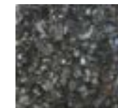
Fire Glass Bronze 39.6 lbs / 18 kgs