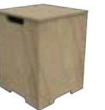
Tank Cover ONB403SY or ONB404SY