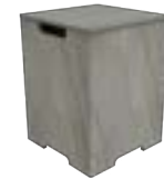
Tank Cover ONB403SG or ONB404SG