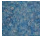
Fire Glass Caribbean Blue 39.6 lbs / 18 kgs