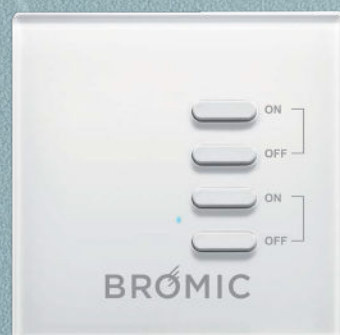
ON | OFF CONTROLLER

Bromic's independent 'On/Off' control will let you control up to two electric or four gas heaters across two separate circuits from up to 100ft away. The wireless transmitter is fully portable or can be easily mounted with the included double-sided adhesive/screws.