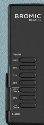
ECLIPSE DIMMER CONTROLLER

Move beyond the base-model wireless controller with the Bromic Dimmer Controller. Suitable for our electric heaters, the dimmer control provides the ability to precisely adjust the electric heat output in 1% increments, or quickly jump by 25% increments, from up to 100ft away.