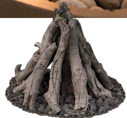
Desert Sage Model: DS-27