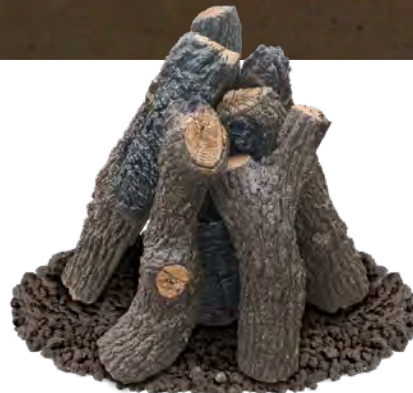
Back Country Oak Model: BCO-27