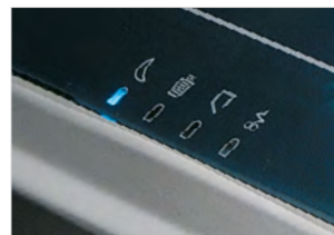
AUTOMATIC DISCONNECTION FROM THE MAIN POWER SUPPLY

Heavy duty chain drive with steel gears which offer reliability and resistance to wear.