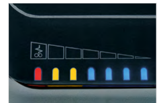
EPC: ELECTRONIC POWER CONTROL

No longer any need to switch off the shredder before leaving the office.