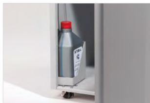
AUTOMATIC OILING SYSTEM

It eliminates the need to manually lubricate the unit, protects the blades with anti-corrosive agents and ensures maximum reliability and efficiency.