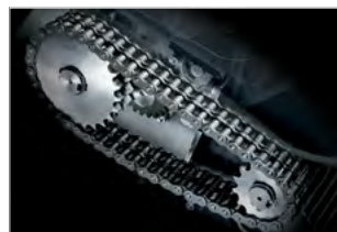
SUPER POTENTIAL POWER SYSTEM

It eliminates the need to manually lubricate the unit, protects the blades with anti-corrosive agents and ensures maximum reliability and efficiency.