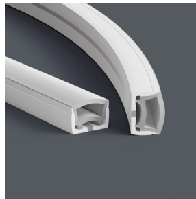
Model: N3020-SF-W SKU: 666561435417