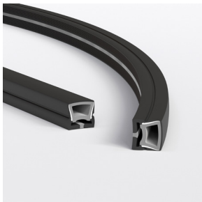
Model: N1616-SF-B SKU: 666561432485