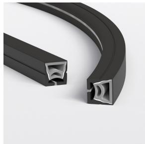
Model: N2020-SF-B SKU: 666561432782