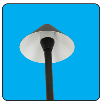
This 22" tall landscape light is particularly effective in creating a warm and inviting atmosphere during the evening hours. Whether placed along garden pathways, near decorative elements, or around the perimeter of outdoor areas.

Job Name: ______ Distributor: _____ Type: