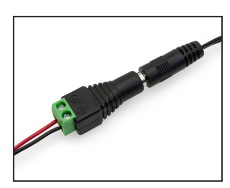
With an easy connector power jack for a DC connection and an AC power cord.