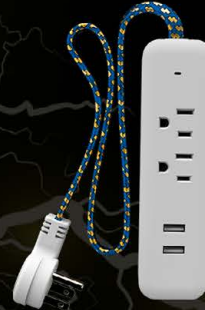
OPSS221-NG UPC: 856476001405