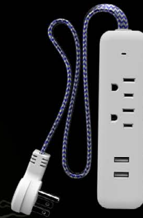
OPSS221-BC UPC: 856476001382