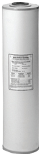
SO-10 Softening Cartridge: DEV9105-41