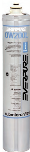
OW200L Replacement Cartridge: EV9619-01

Delivers premium quality drinking water for bottleless coolers and drinking fountains