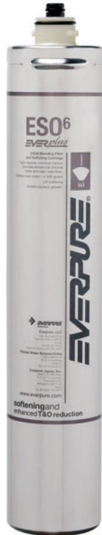
ESO 6 Replacement Cartridge: EV9607-10

Unique three stage blending cartridge provides softened/buffered/filtered water