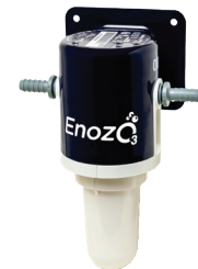
HS-5284 EcO 3 Ice Fast Flow Ozone System