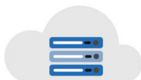
SECURE CLOUD SERVER