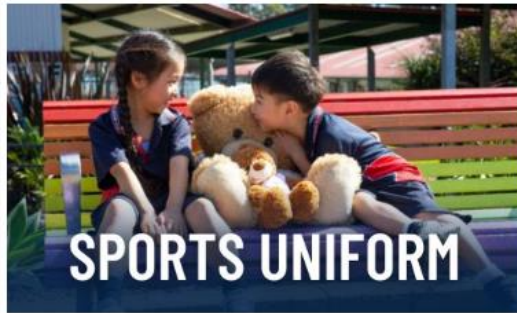
Sherwood Ridge Sports Uniform