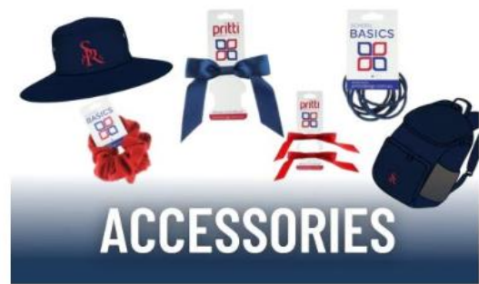
Sherwood Ridge Uniform Accessories