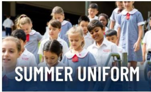
Sherwood Ridge Summer Uniform