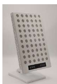
LED light table device