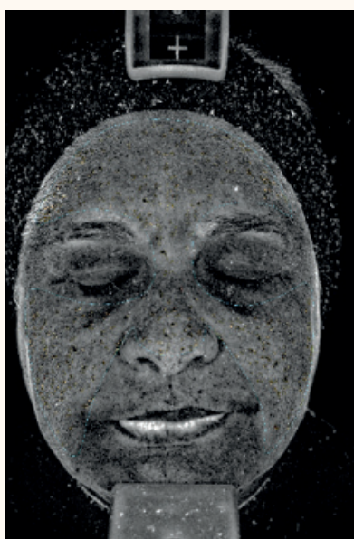
Macrophotography using the VISIA CAS System with UV spots count Subject #21