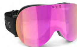
219 Two - Pink Orchid | White, pink mirror lens

WHSP:. $5260.53 INDENT: $227.96 RRP: $495.00