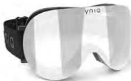
211 Two - White Star | White, silver mirror lens

WHSP:. $5260.53 INDENT: $227.96 RRP: $495.00