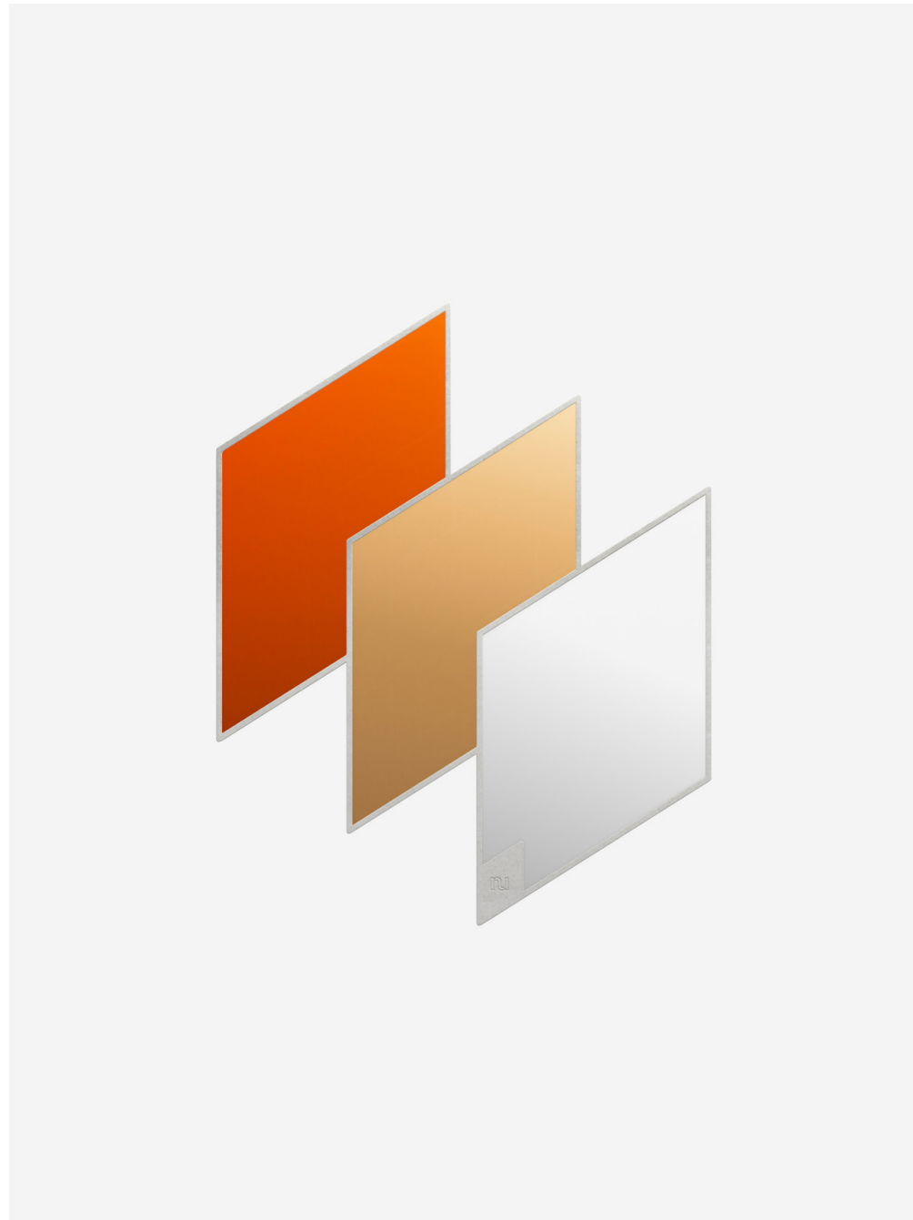
Mirage Collection Serie 01

The Flow mirror is a dynamic and bold home accessory. It is composed of three acrylic mirrors, including one orange mirror at the top, one gold mirror in the center, and one silver mirror on the bottom.