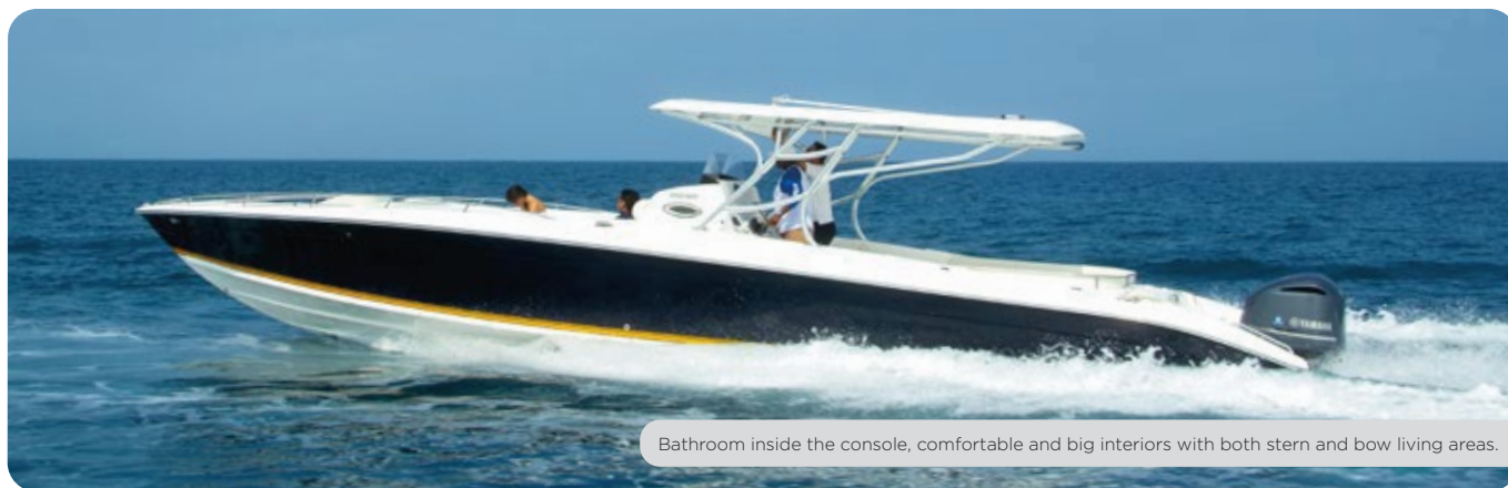
Bathroom inside the console, comfortable and big interiors with both stern and bow living areas.