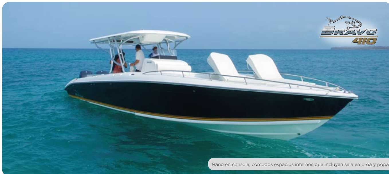
Baño en consola, cómodos espacios internos que incluyen sala en proa y popa