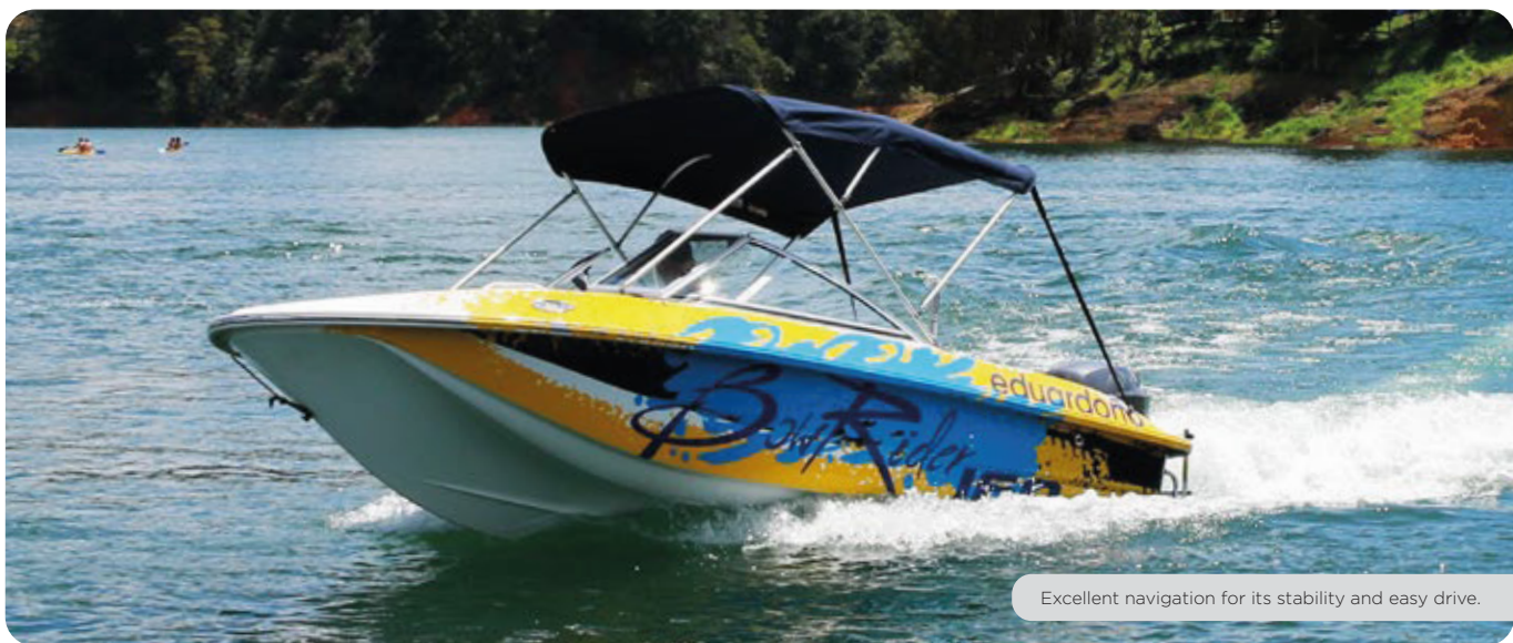
Excellent navigation for its stability and easy drive.