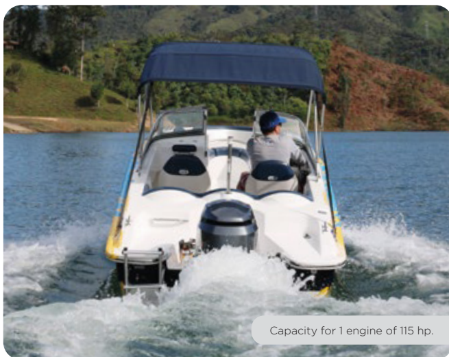
Capacity for 1 engine of 115 hp.