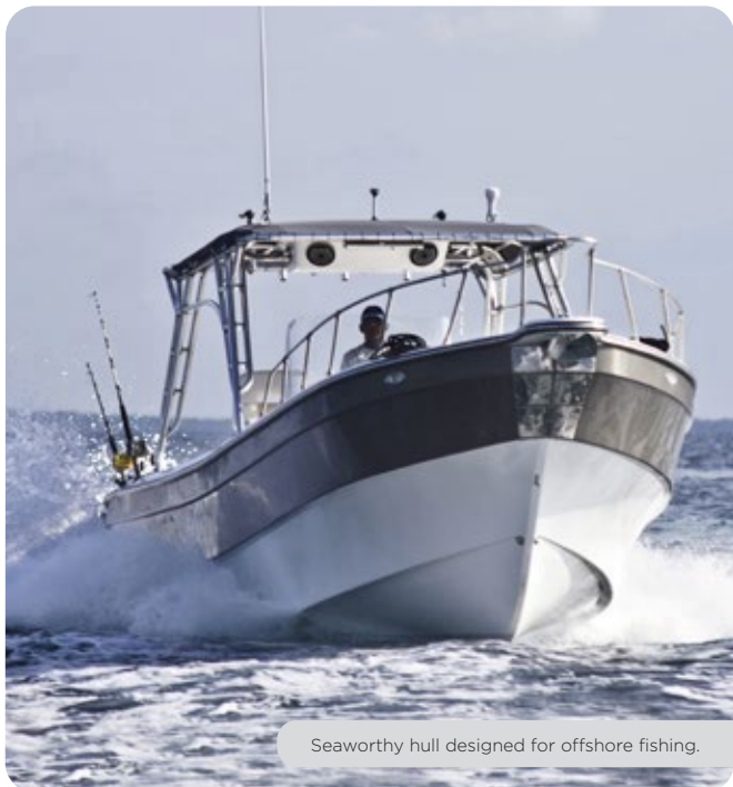
Seaworthy hull designed for offshore fishing.