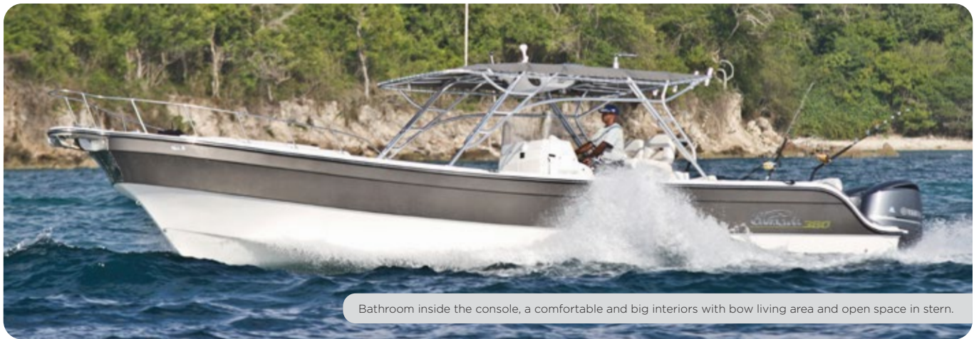
Bathroom inside the console, a comfortable and big interiors with bow living area and open space in stern.